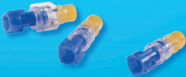
Intermittent Injection Site